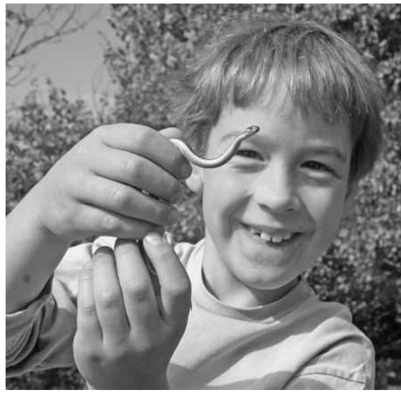
Sense of place develops positive relationships and a community perspective with the natural world.

Sobel (2008) recognizes seven key principles of children's interaction with nature. Teachers should take advantage of these tendencies in developing teaching plans and projects to promote sense of place for children. With a little imagination, the applications are endless.