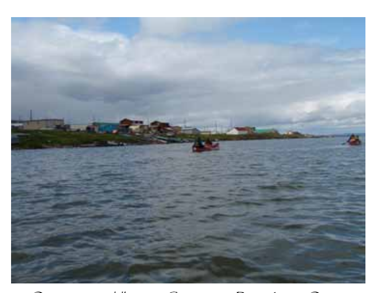
Our group paddles into Coronation Bay, Arctic Ocean. The village of Kugluktuk, Nunavut, is in the background.

the spirit of the tundra stays with me—the memories of the wolf and the different ways that people are connected to the earth's cycles inspire me to reconnect to the natural environment in more urban ways, as on my walk to school. Reflection on these instances makes me wonder how to create these kinds of moments for other people on a smaller scale and in urban contexts, because next semester I will be working with soon-to-be teachers in outdoor education. I think what follows in our featured articles and practical activities helps: within are ways to engage students and spend time in the natural environment, and inspirational features that provide a rationale for why we do what we do. With that said, I hope you find this issue insightful and share the nuggets with friends. I look forward to meeting you in Canmore at our upcoming conference, in May. Save the date and read on!