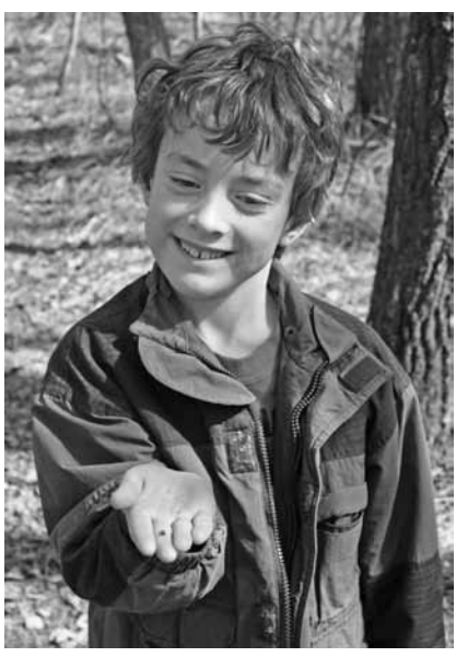
Discovery of small creatures helps create new types of bonds with nature.

Third, from a health perspective, outdoor activities in nature are recognized as being critical to normal childhood development (Louv 2005). Moreover, children and teachers who have regular access to green spaces have less stress and recover faster from mental fatigue (Charles et al 2008). Children in a Scandinavian "Outdoors in All Weather" program