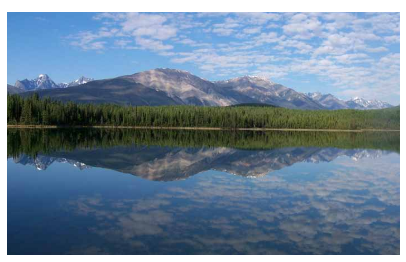
Rabbit Kettle Lake, NWT

The newsletter of the Global, Environmental & Outdoor Education Council