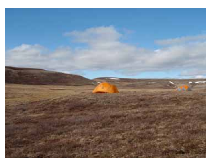
Burnside River, Nunavut

The Burnside River travels through a treeless landscape. When you look up and around, the tundra is seemingly endless. However, when you look down during the summer, it is difficult to believe that this area is