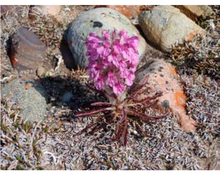
The wooly lousewort pictured here is about 10 cm tall.

It was with great sadness that I boarded the plane in Kugluktuk and returned to Edmonton and my PhD studies. It took great effort to resume my schedule of reading and writing and sitting for hours at a time at my desk. However,