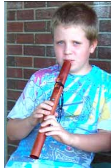
Boy playing flute

Flutetree — www.flutetree.com —an excellent source of notes and tablature for many traditional, contemporary, and folk songs transcribed especially for the Native American flute