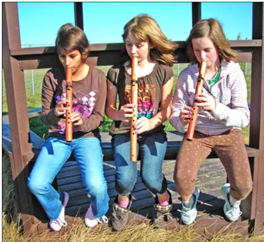
Girls playing in the wind

Always, the voice of the flute represents a peaceful time together, connectivity and unity shared among the flute circle members and the muses and mentors with whom their pathways connect, a bond with our natural world, and a sense of being in touch with one's soul.