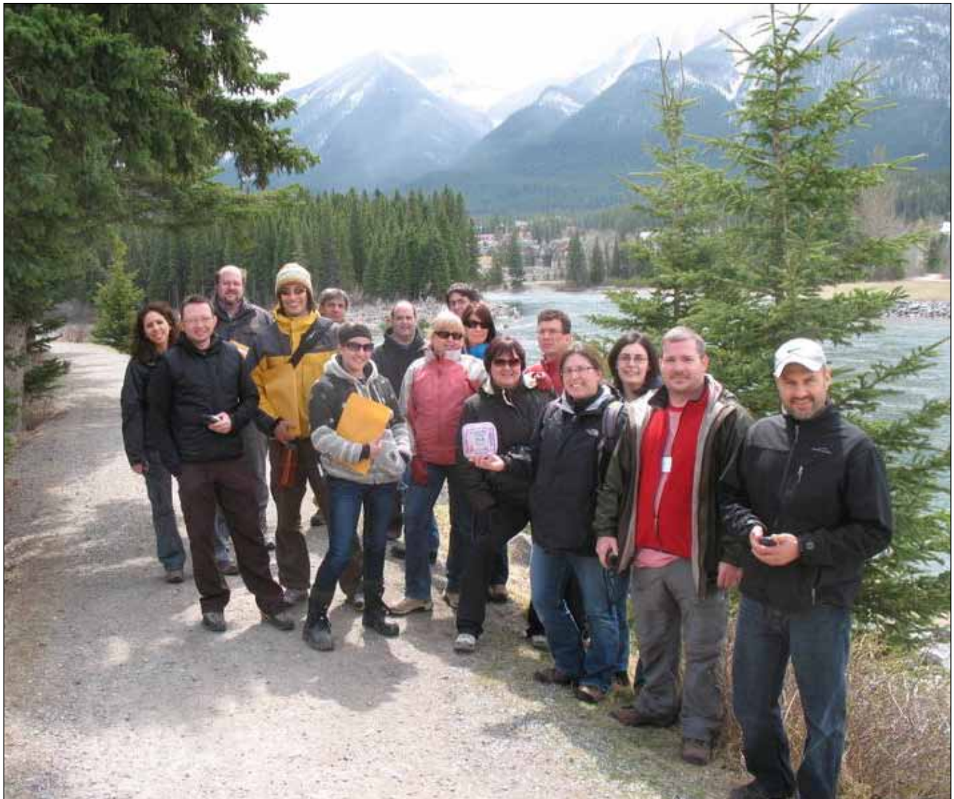
Conference participants learn about geocaching at GEOEC's annual conference in Canmore, Alberta, May 6-8, 2010.

The newsletter of the Global, Environmental & Outdoor Education Council