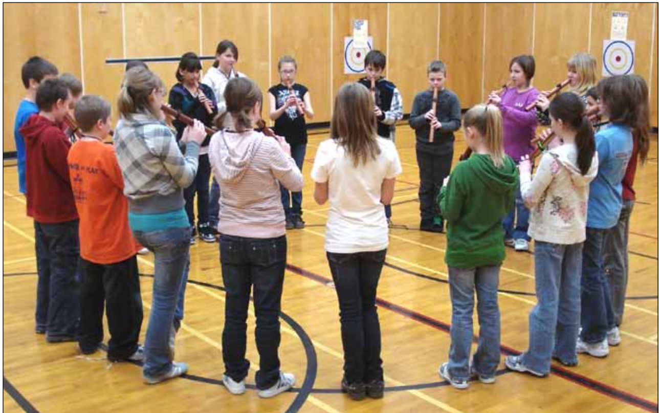
Peaceful Night Flute Circle of Bonanza School

the lore and listening to the voices of the ancestors. Through this music, we come to know a little more of ourselves, each other, and our world—past, present and future. We become grounded through the stories of our Earth, becoming acquainted with our nature in and through nature, and through this instrument of wood, branch and wind.