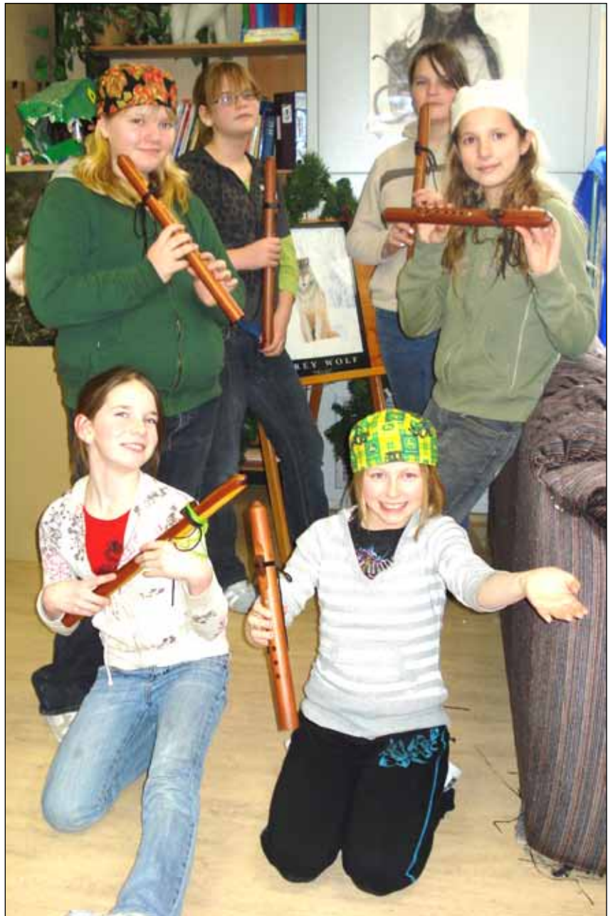
Girl power 2010

This, then, is the humble journey of the Peaceful Night Flute Circle ... it has become a way of being. This is our pathway—one more beautiful means of conveying our souls and selves through our lives, living, learning, laughing, loving, and sustaining inner joy and peace through songs and stories of past and present, as we continue to forge essential relationships with each other and our Earth. We play this music because we love to play it—sustaining the soul through the song of the cedar flute.