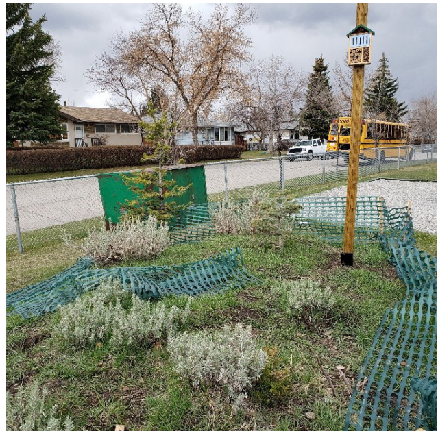
St James School outdoor classroom, rain gardens and bee hotels